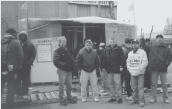
Workers at Quality Meats won a new contract with $300 in economic adjustments and a $600 increase in the annual good-attendance bonus, in addition to other wage increases and improvements.

The new contract includes wage increases of up to $1.05 per hour in the first year and as much as 70 cents per hour in the second and third years. By the end of the contract, the employer will contribute 95 cents per hour, on behalf of each worker, to the Canadian Commercial Workers Industrial Pension Plan (CCWIPP). The employer's dental plan contributions also increase to 30 cents per hour, per worker.